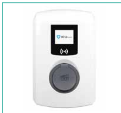
The Alfen Mini 7.36kW charger

It should be noted that there are other means of charging at home but by using these methods one would extend the time required to charge the electric vehicles battery as the methods shown below relate to what is known as Slow Chargers.