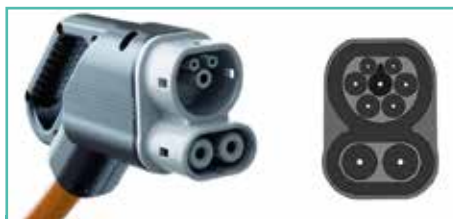
The CCS male and female connector.

These rapid and ultra-rapid chargers typically take the EV battery charge from 10% to 80% of the capacity in a relatively short time. The length of time that the BEV will take is dependent on the rapid charge ability of each BEV and on whether the BEV uses the CCS connector or the CHAdeMO rapid charge connector system.