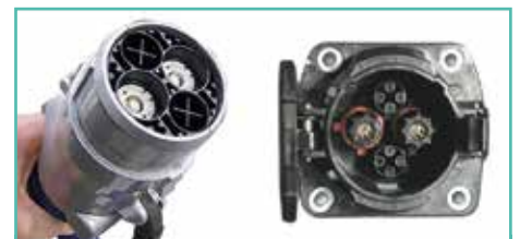
The CHAdeMO male and female connector.

The connector system which appears to be gaining the most traction in Europe is the CCS system, the maximum amount of power that can be transferred on the CCS system is 350kW. Whereas the maximum power the CHAdeMO system can transfer is 62.5kW. Car manufacturers are also bringing out newer models which can take advantage of this greater charge rate.