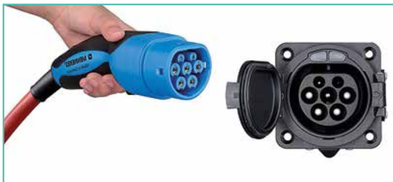
The type 2 male and female connectors.

The typical EV charger that would be installed at home is the 7.36kW type 2 single phase charger. It is usually assumed that a home charger could recharge a vehicle in a single overnight period. When this type of wall box charger is fitted to your house it is currently possible to claim an OLEV grant towards the cost of the charger. The picture below shows the type 2 connector configuration for the 7.36kW fast charger.