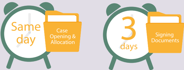
Case opening and allocation

Geldards outperformed their performance standards for case opening and allocation (same day) and issuing day 20 reports (100%) but were 3 days outside their performance standard for signing documents.